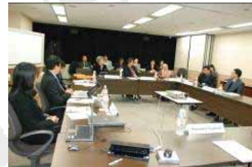
Expert meeting on public sector productivity