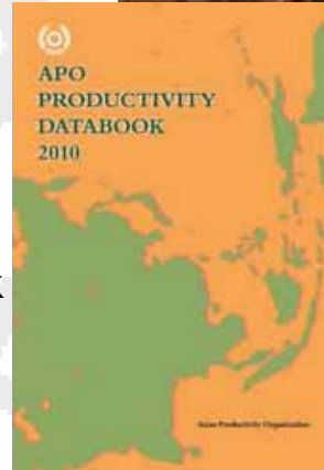
APO Databook and Database