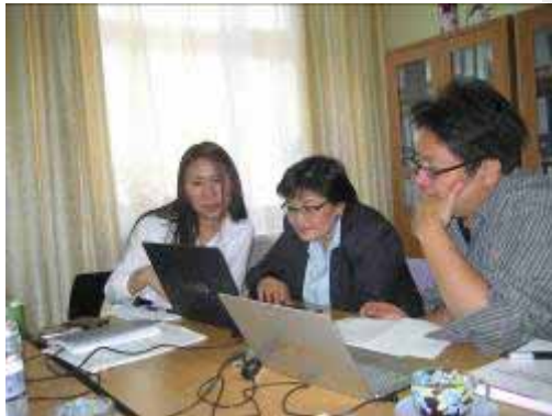
Productivity Expert assigned to Mongolia